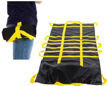
Rescue Sheet - Compact Comes with a yellow strap and a karabiner