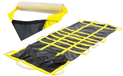
Rescue Sheet - With PVC handles Comes in a carrying bag